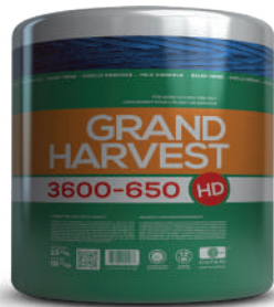
GH 3600-650 HD